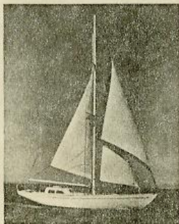
REEFED MAIN & JIB