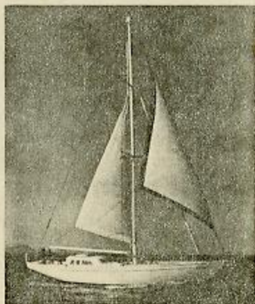
NOW IT'S A SLOOP